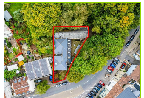
The Old Police Station, Jacobs Wells Road, Cliftonwood, Bristol, BS8 1DR